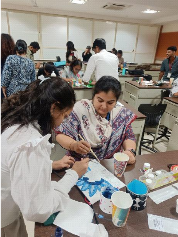
Texture art workshop

• Recognized under Section 2f of UGC Act, 1956 • ISO 21001 : 2018 Certified