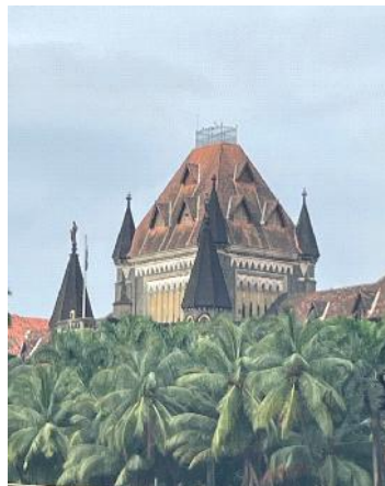
Mumbai High Court