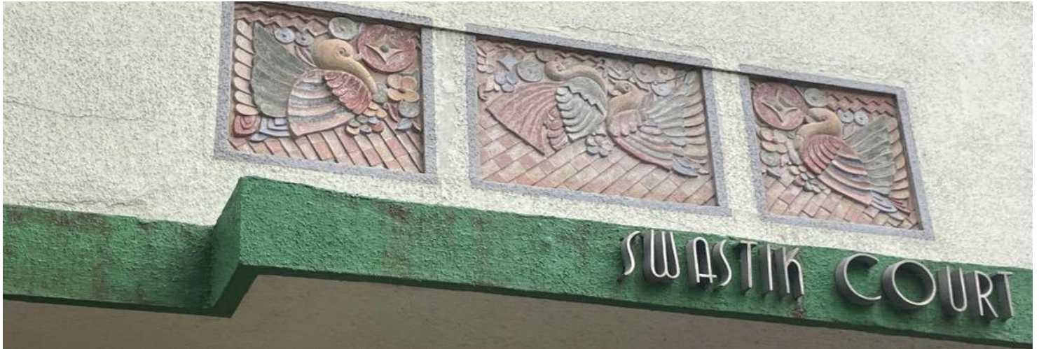
Student's enthusiasm for Heritage walk.