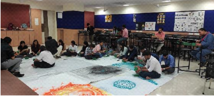
Clay modelling workshop

• Recognized under Section 2f of UGC Act, 1956 • ISO 21001 : 2018 Certified