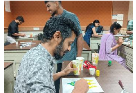
Tie and Dye workshop