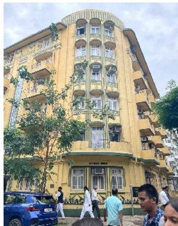
Shiv Shanti Bhuvan Art Deco Mumbai

Heritage plays an important role for the development of history and character of the city through generating interests and involvement of the next generation Architects in the urban conservation activity.