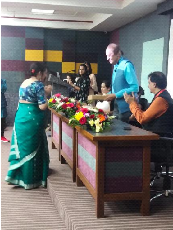
Principal and Vice Principal welcoming Guests

• Recognized under Section 2f of UGC Act, 1956 • ISO 21001 : 2018 Certified